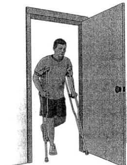
Going through a doorway