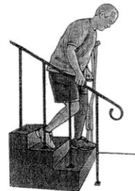
Using a handrail